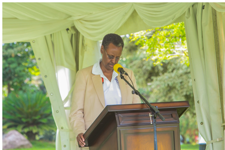
The First Lady Janet K. Museveni addressing the Youth

The First Lady of Uganda, Maama Janet K. Museveni, welcomed the INUKA AFRIKA delegation to Uganda. She acknowledged their presence as a divine appointment, as Uganda was in the midst of celebrating her 60 th Independence Anniversary.