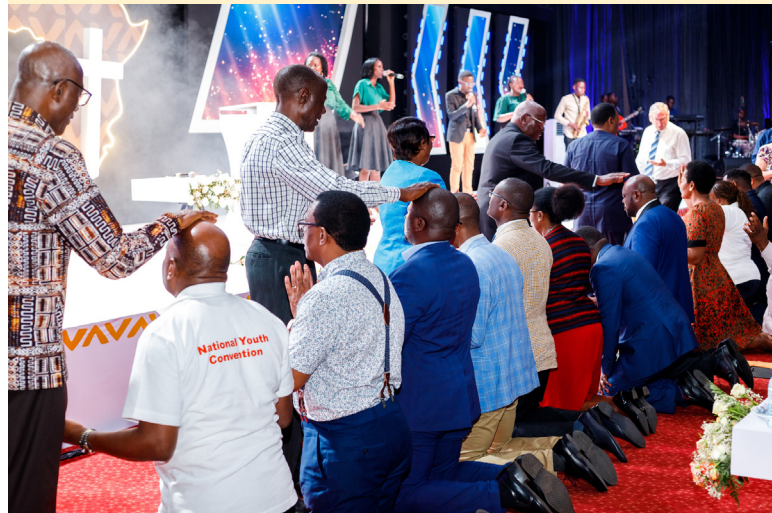
Leaders being prayed for at the Conference