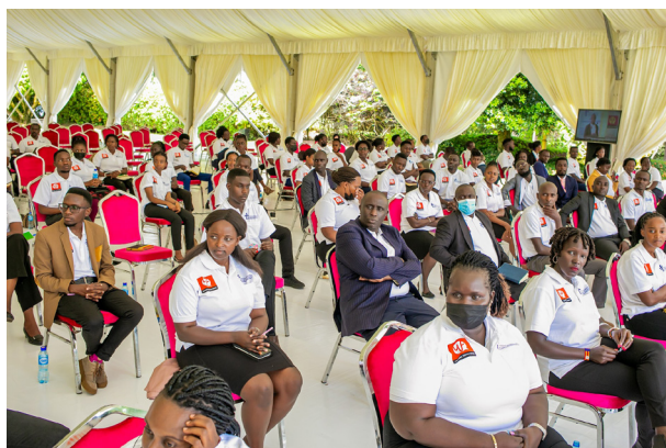
Participants attending the Uganda Youth Forum at State House Entebbe