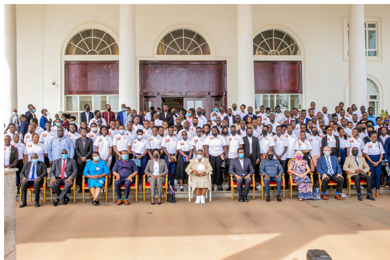
Uganda's First Lady, Janet K. Museveni and the INUKA AFRIKA Delegation with participants of the Youth Forum at State House Entebbe.

In light of Daniel 6:12, Mama Janet challenged the youth to discover their life purpose and to always glorify the Lord with their lives.