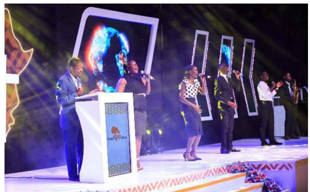
The Deliverance Church Choir leading worship